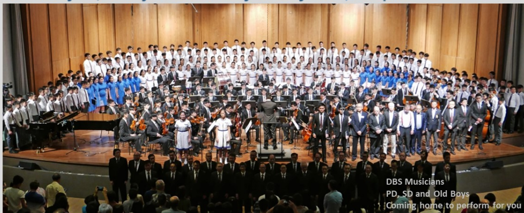
DBS Musicians PD, SD and Old Boys Coming home to perform for you